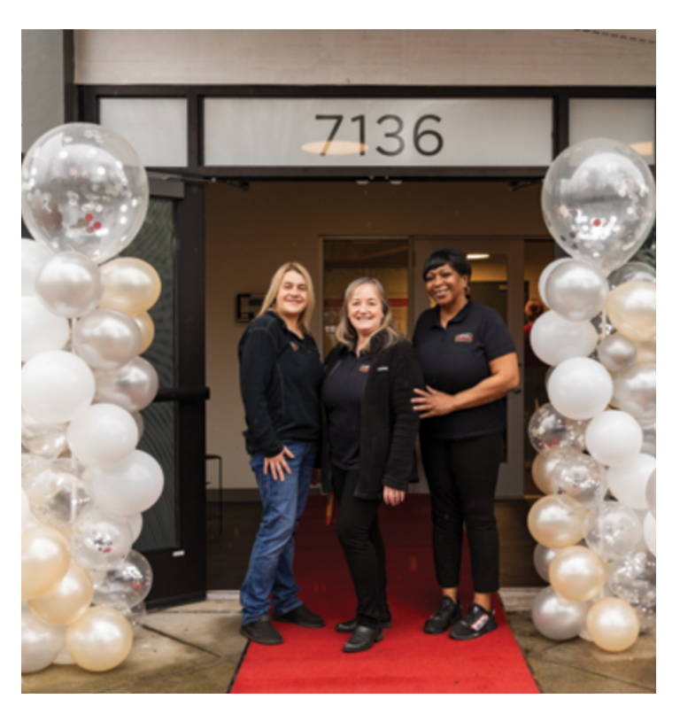
New Women & Children Shelter Grand Opening - January 2024

To see every homeless neighbor — beloved, redeemed, restored